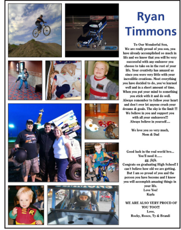
Full page ad: approximately 8.33" x 10.67"